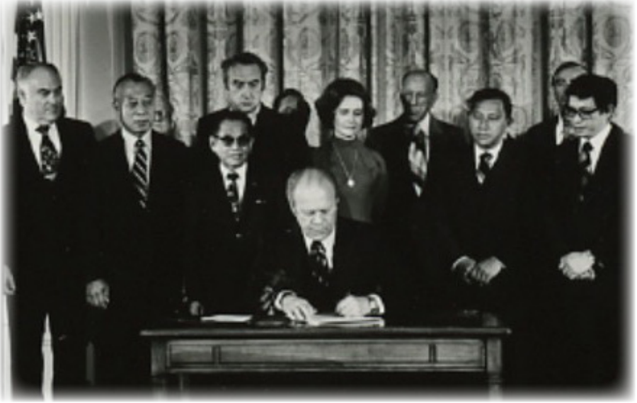
President Gerald R. Ford signing H. J. Res. 549 Marianas Covenant in the East Room of the White House.