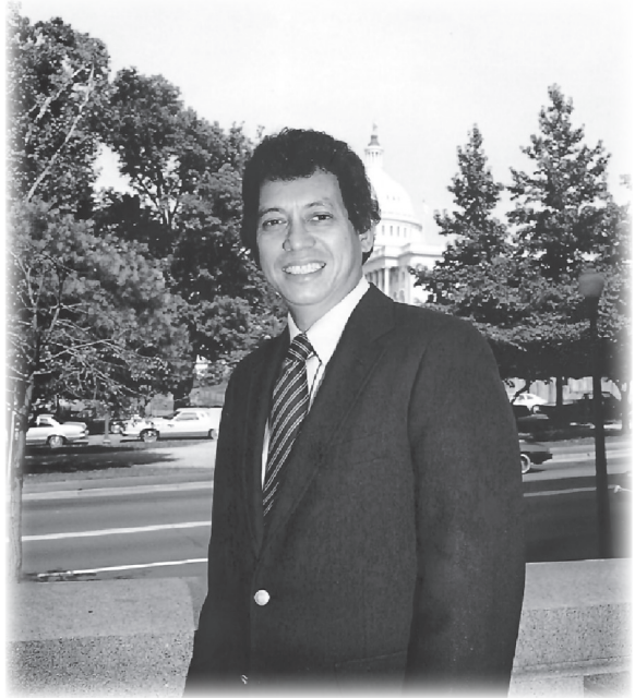
First-elected resident representative of the CNMI to the United States. Taken in front of the United States Capitol, Washington, DC.