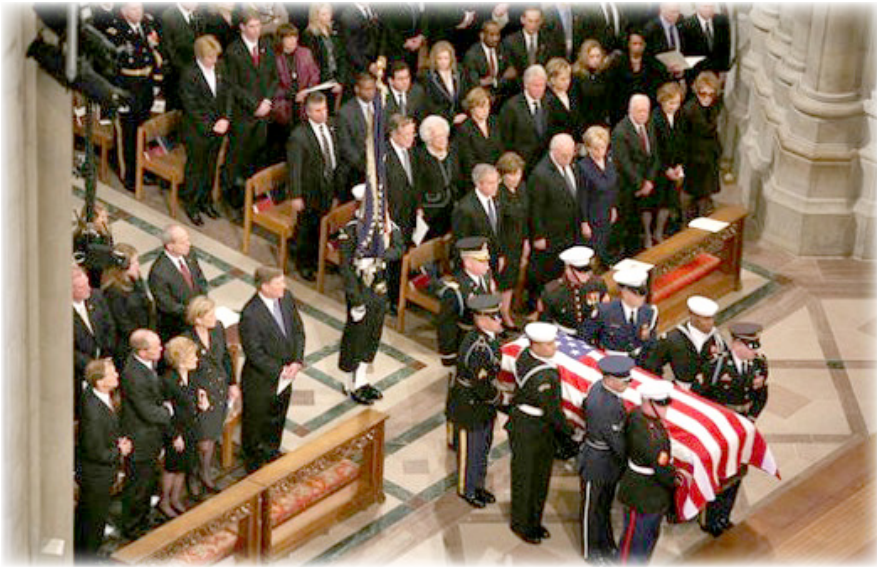
The casket of former President Gerald R. Ford is carried by military pallbearers to the front of the National Cathedral during his state funeral in Washington, D.C., January 2, 2007.

Gerald Rudolph Ford, the 38th President of the United States, died at his home in Rancho Mirage, California on December 26, 2006. His importance to the people of the Northern Marianas is celebrated annually, but it was an honor to be especially connected to him during that time. A few days before his funeral service in Washington, D.C., I received a personal invitation from the office of former First Lady Elizabeth “Betty” Ford on behalf of her and her family, extending an invitation to me on behalf of the people of the Northern Mariana Islands to attend the former president’s funeral service at the Washington National Cathedral. Upon my arrival at the cathedral, a major in the United States Army escorted me to my seat. I was seated in the pews reserved for the president’s family, friends, and special guests. It was an honor. I was humbled and grateful for this magnanimous gesture of the invitation by the former first lady.